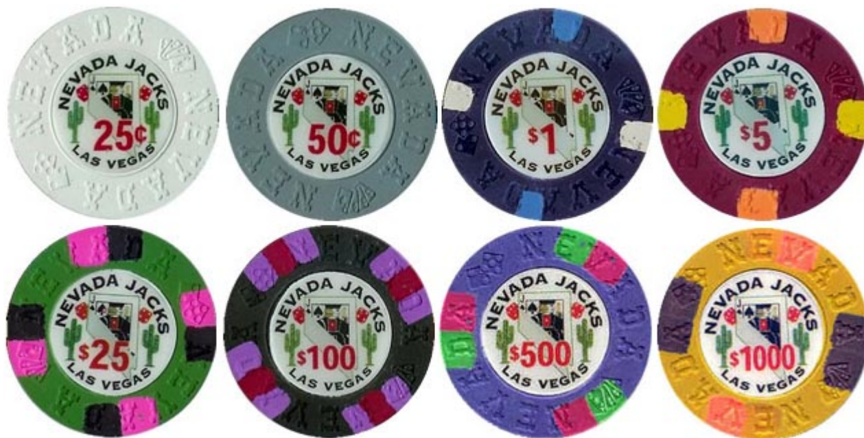
The recent chips from Blue Chip co.